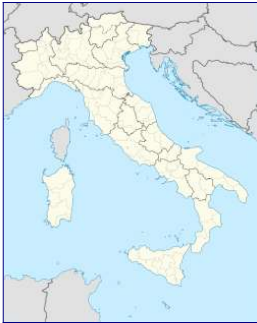
Tenno Location of Tenno in Italy