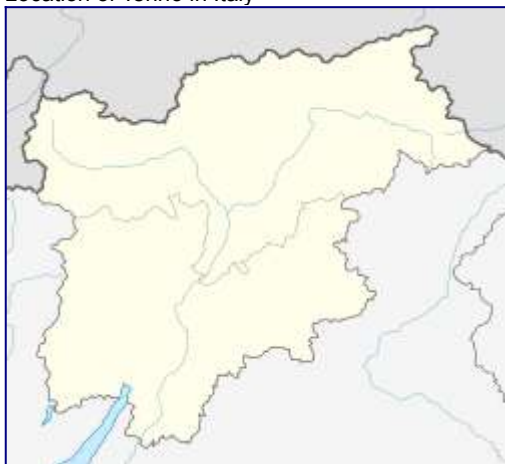
Tenno Tenno (Trentino-Alto Adige/Südtirol) Coordinates: 45°55'N 10°50'E

Country Italy Region Trentino-Alto Adige/Südtirol Province Trentino (TN)