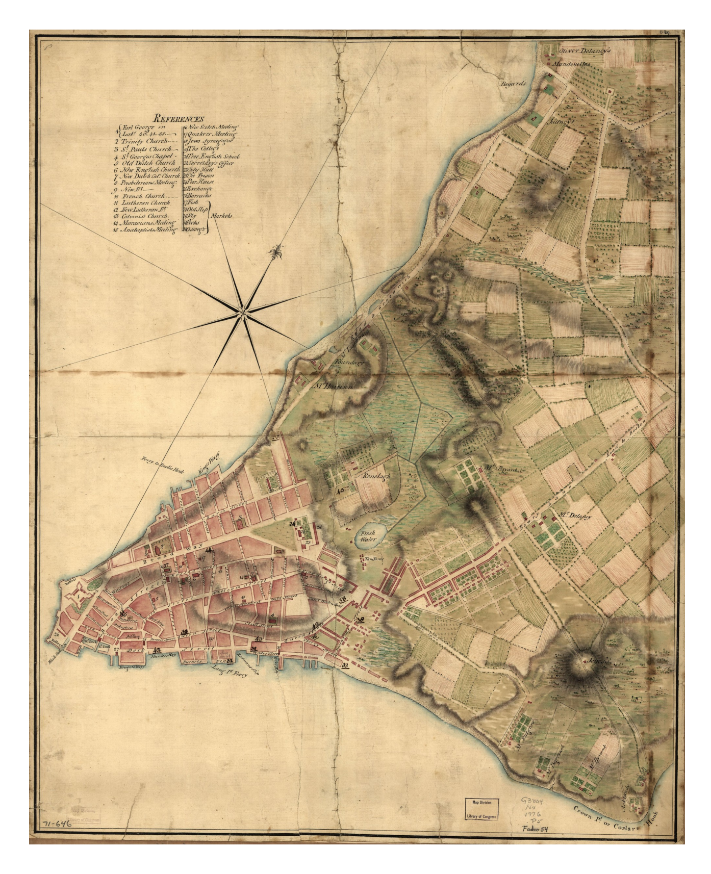
(A Plan of the city of New York. LOC \ensuremath{\mathsf{GM71000646}}.\ensuremath{\mathsf{Tif}}