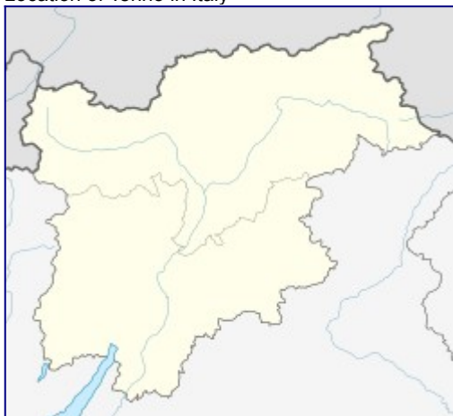
Tenno Tenno (Trentino-Alto Adige/Südtirol) Coordinates: 45°55'N 10°50'E