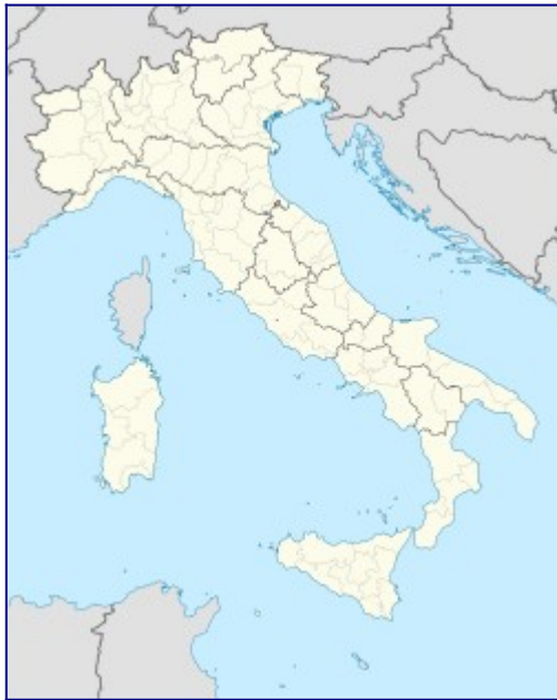
Tenno Location of Tenno in Italy